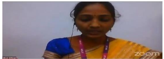
MKJC-"INTELLECTUAL PROPERTY RIGHTS (IPRS) AND IP MANAGEMENT ...