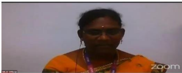
MKJC-"INTELLECTUAL PROPERTY RIGHTS (IPRS) AND IP MANAGEMENT ...