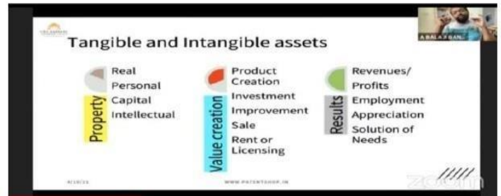
MKJC-"INTELLECTUAL PROPERTY RIGHTS (IPRS) AND IP MANAGEMENT ...