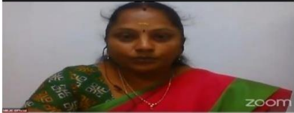
MKJC-"INTELLECTUAL PROPERTY RIGHTS (IPRS) AND IP MANAGEMENT ...

“Intellectual Property Rights (IPRS) and IP Management for start up”