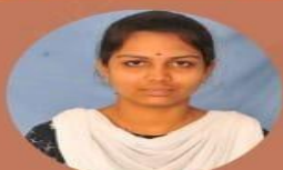
PRIYA II BBA

DEPARTMENT OF BUSINESS ADMINISTRATION STUDENTS COLLOQUY ON "STOCK EXCHANGE IT'S PROSPECTS, OPPORTUNITIES AND THREATS"