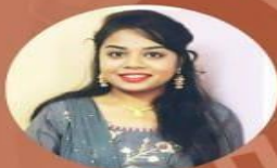
POOBANASRI B III BBA